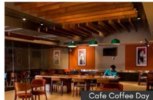
Cafe Coffee Day