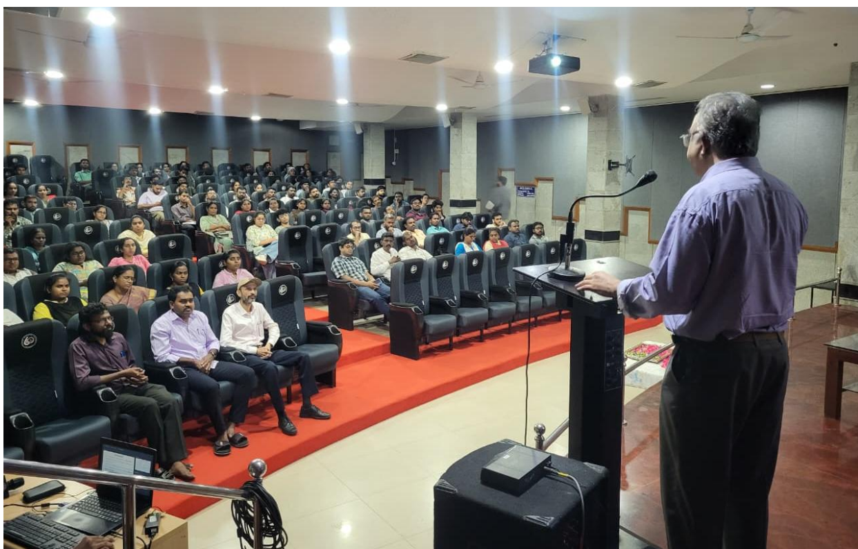
Training Session on Web of Science Database on 12.08.2025