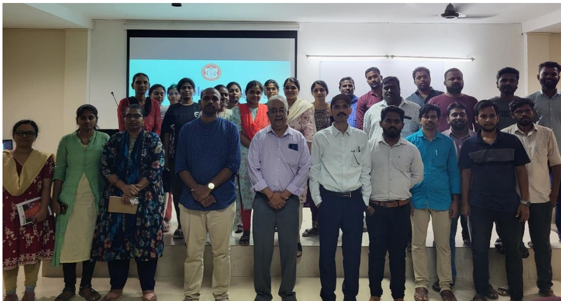
Library Orientation on Library Resources & Services for Research Scholars held on 23.04.2025