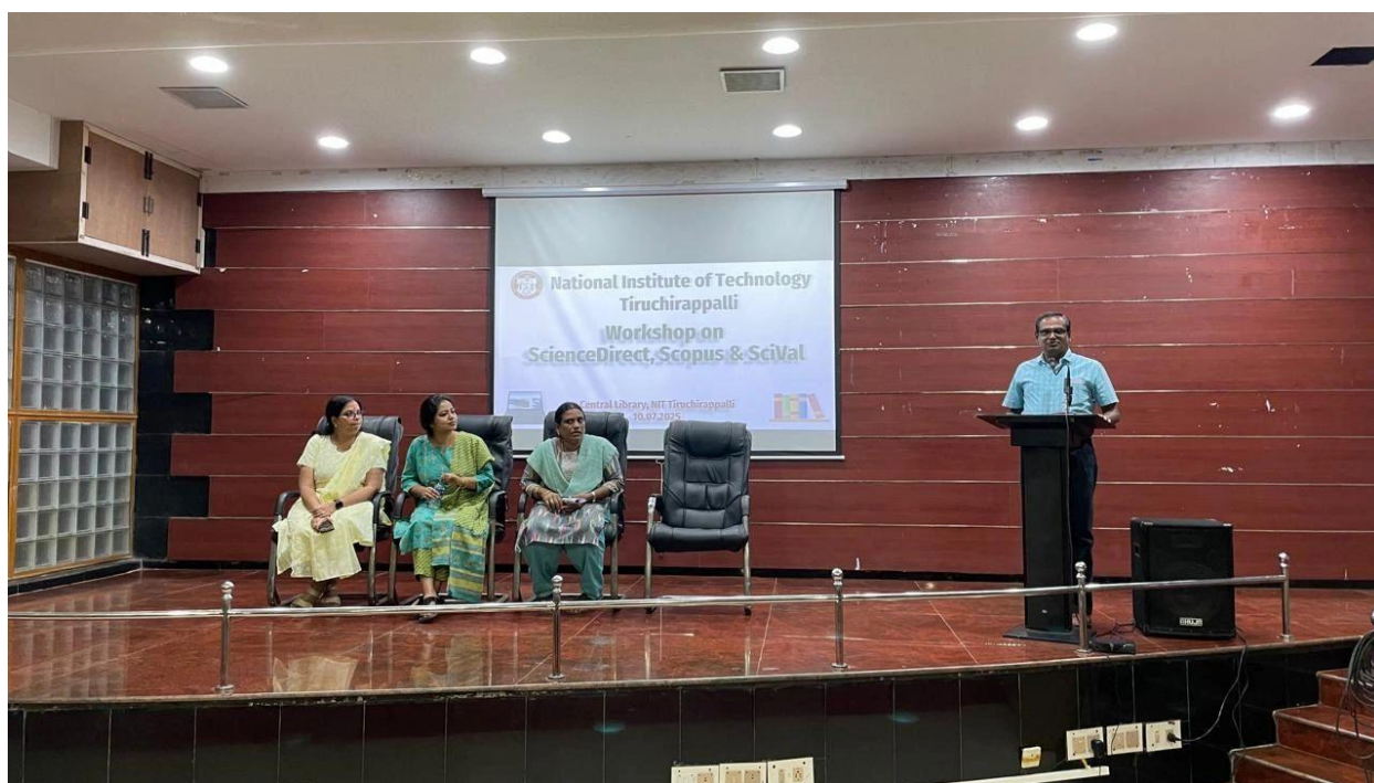
Workshop on ScienceDirect, Scopus & SciVal on 10.07.2025