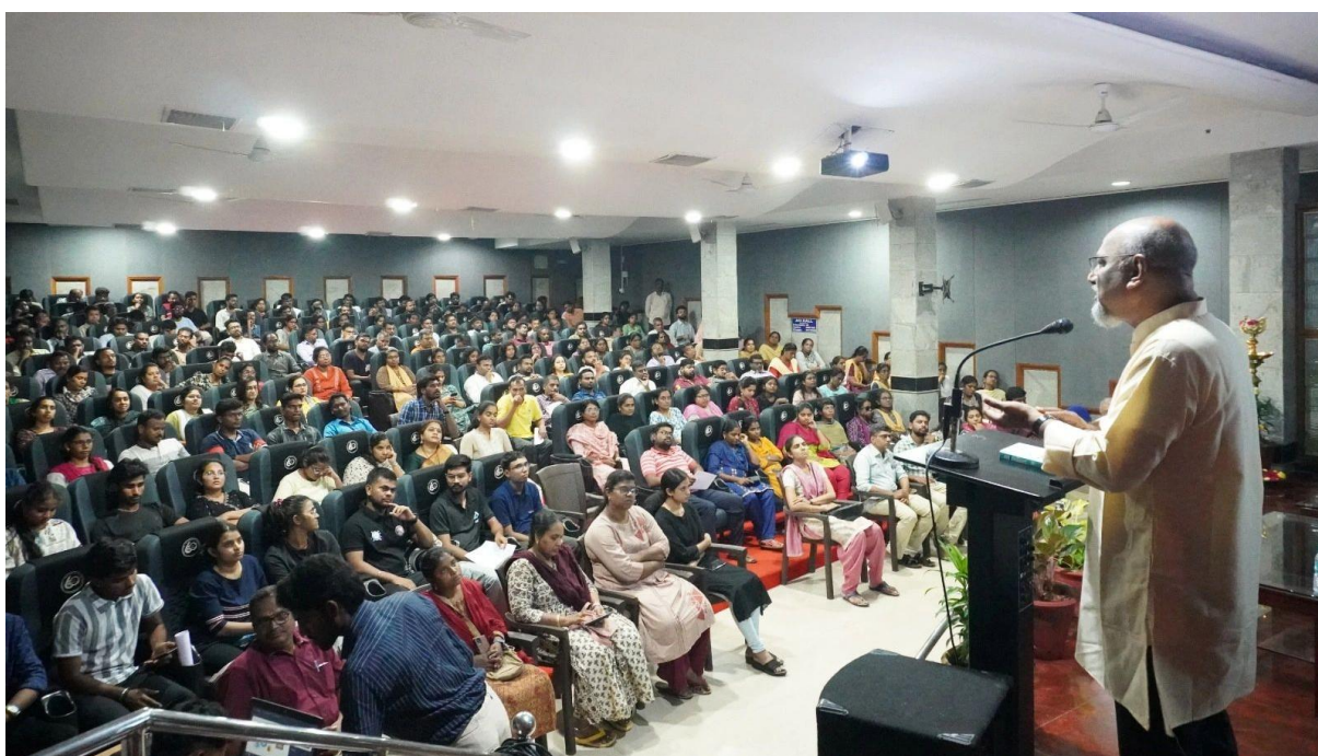
30 th P.N. Panicker National Reading Day on 19-06-2025