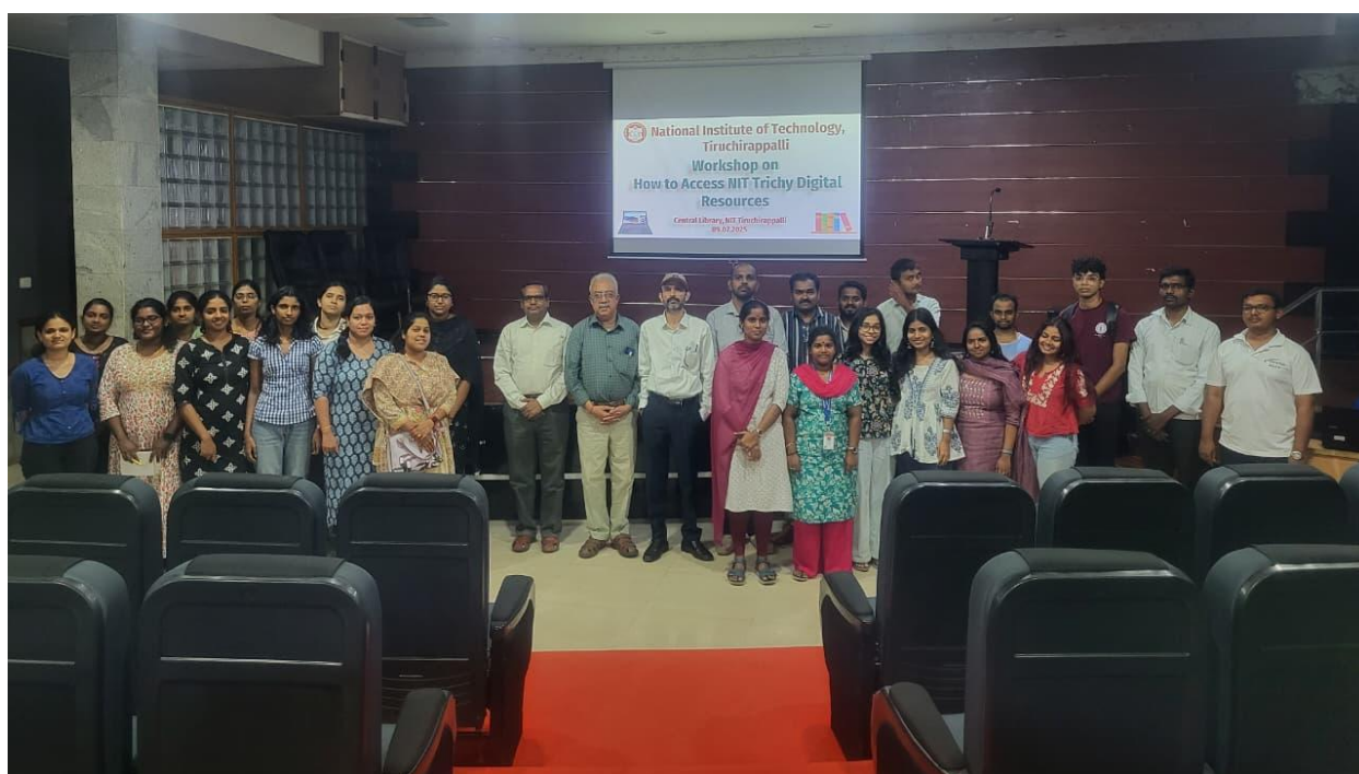
Workshop on How to Access NITT Digital Resources on 09.07.2025