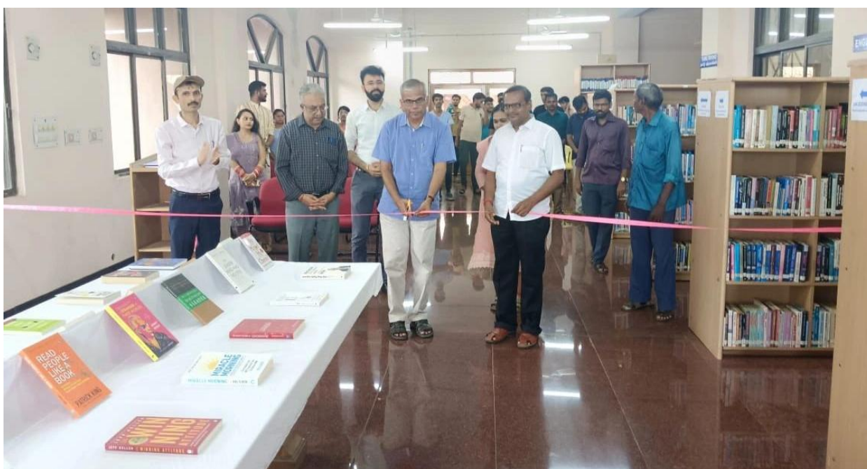
Establishment of P.N. Panicker Reading Corner on 25.06.2025