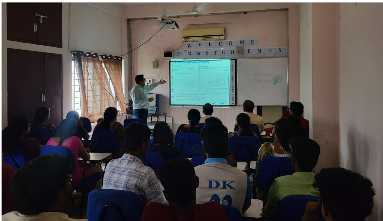
Training Session on SciFinder Database on 13.08.2025