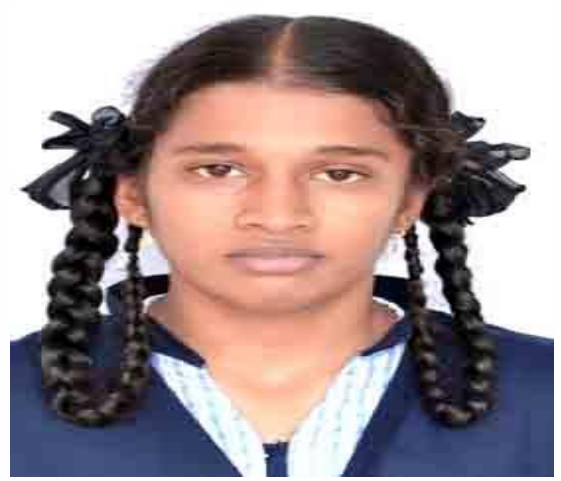
Received coaching for JEE Mains

A government school student coached for JEE Mains by members of a 'social responsibility club' of National Institute of Technology- Tiruchi (NIT-T) has realised her dream of securing admission in the institution.