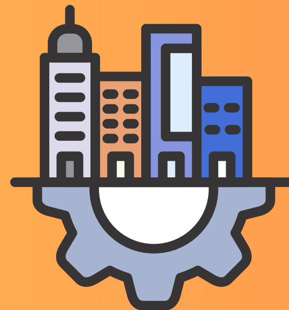
NITT Lab / Infra