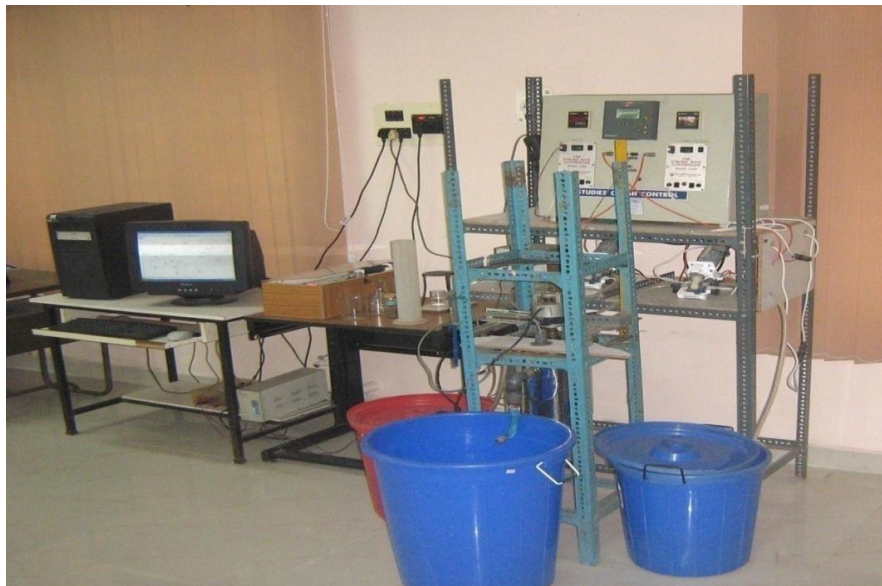
Quadruple Tank System