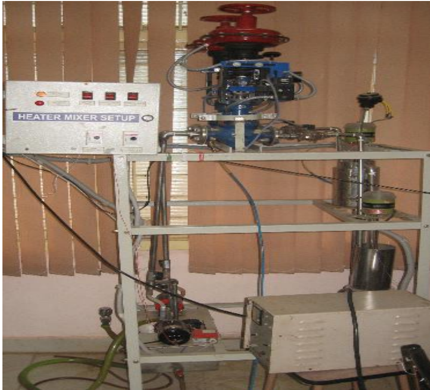
Heater-Mixer Set up