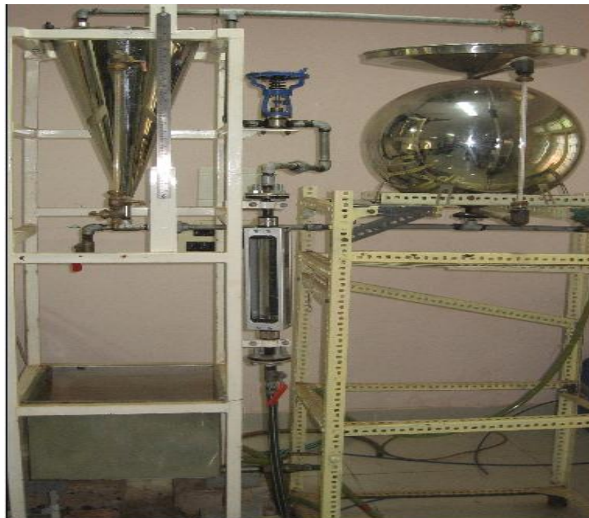
Conical and Spherical Tank System