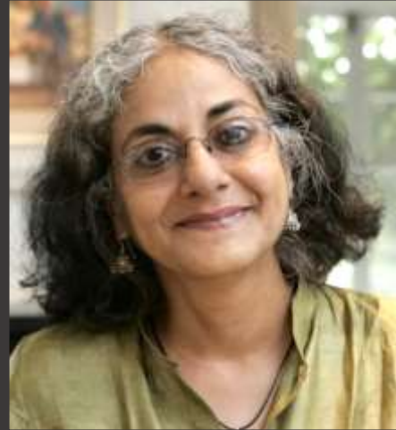
MS. GITHA HARIHARAN Author