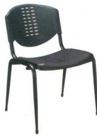
Sample model of chairs without desklet