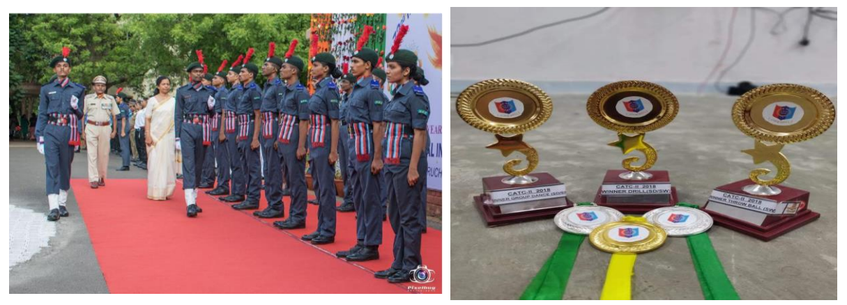
Independence Day 2018