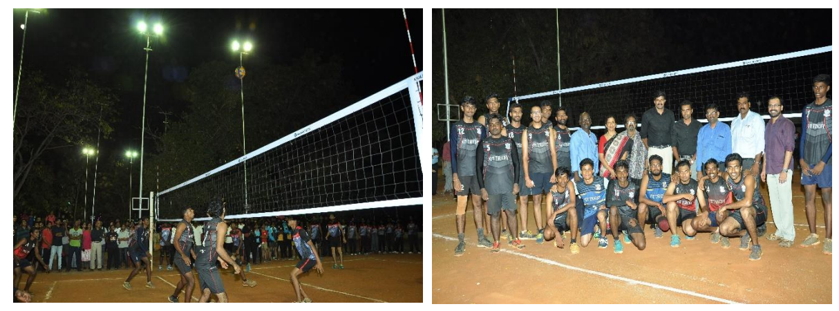
Inter NIT Sports Meet