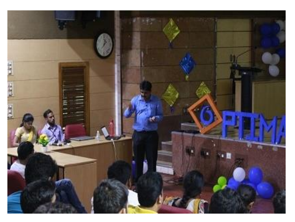
27<sup>th</sup> and 28<sup>th</sup> October Optima 2018