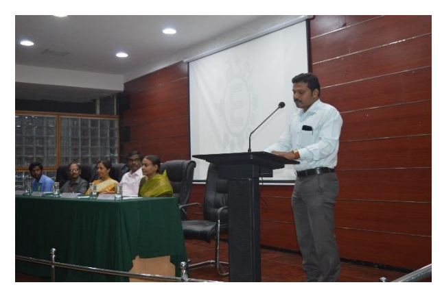
Energaia 2k19, 21<sup>st</sup> March 2019