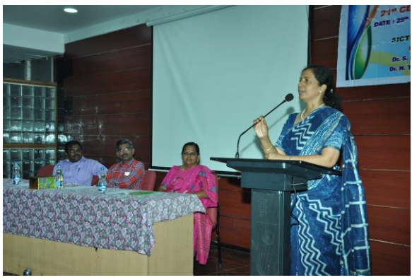
FDP on "Empowering Teachers in 21<sup>st</sup> Century Skills Education"