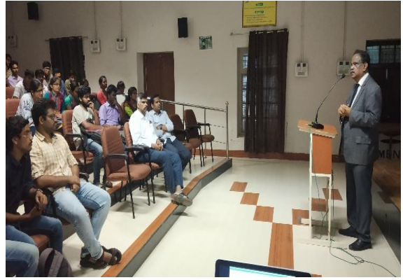
Industrial Lecture on Intelligent Transportation System