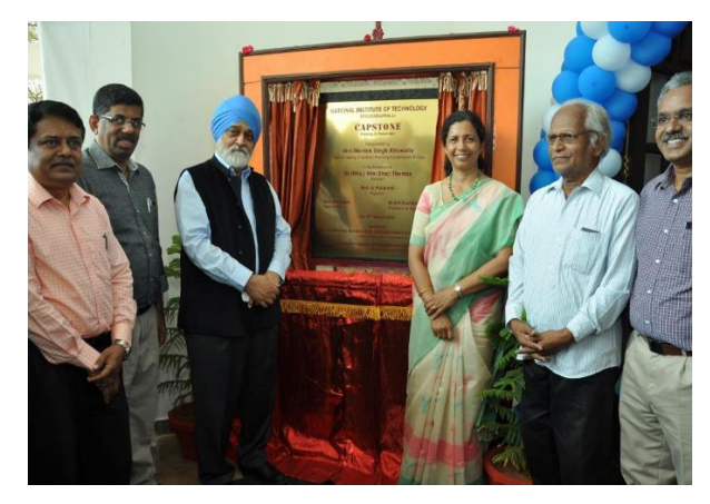
Inauguration of New Training & Placement Building 'CAPSTONE'