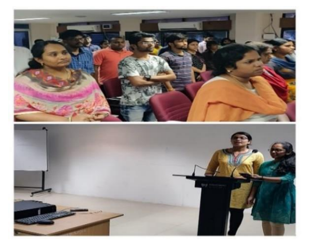
October 2<sup>nd</sup> 2018 – Mahatma Gandhi's 125<sup>th</sup> Birthday celebrations