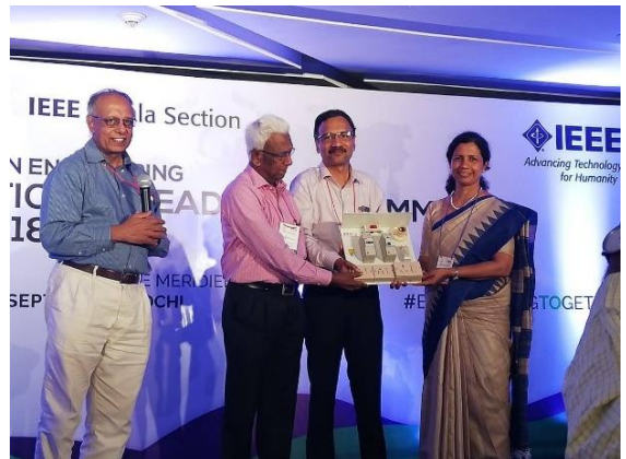
Supply of 500 temporary Electrical Distribution boards to flood affected homes of Kerala in association with IEEE