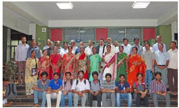
ECE Department Golden Jubilee Year celebration-2018