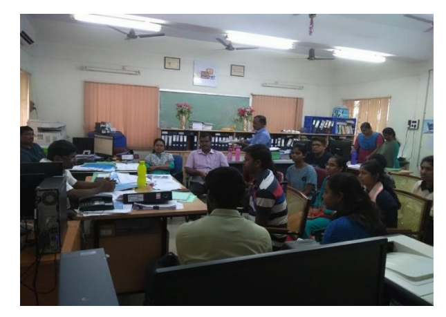
Interaction of DBRAIT students and faculty TEQIP Officials