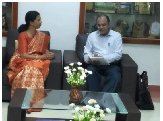
TEQIP – III Mentor Visit to NIT, Tiruchirappalli