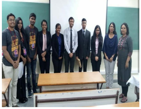
Panel Discussion with Experts from IIT Madras