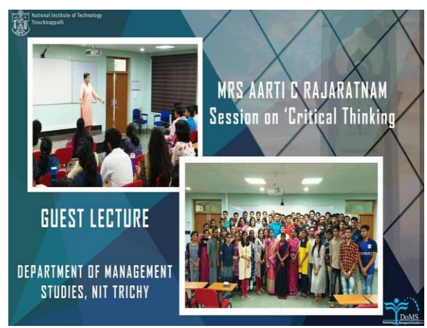
Guest Lecture on "Critical Thinking"