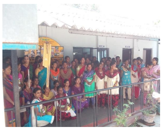
Entrepreneurship Awareness Camps (under the DST – NIMAT)