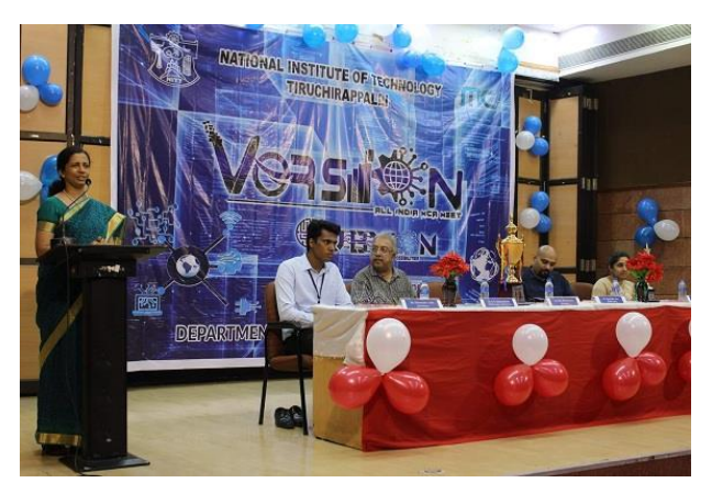
1<sup>st</sup> and 2<sup>nd</sup> Sep Version 2018