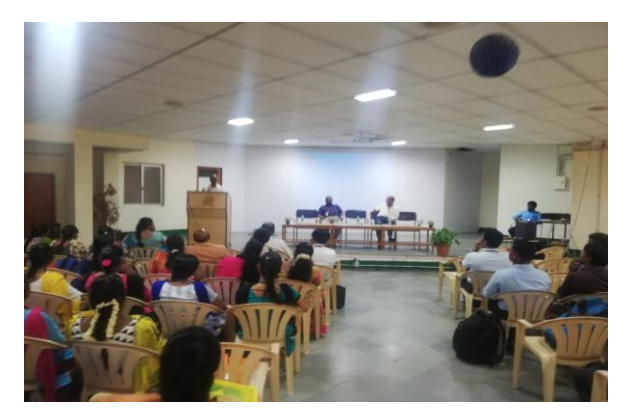
Short term courses on Data Science (Al&ML), blockchain technology (Business Innovation and application), under Cloud Computing (A Practical Approach) on March 11<sup>th</sup> to 15<sup>th</sup> 2019 at Chennai