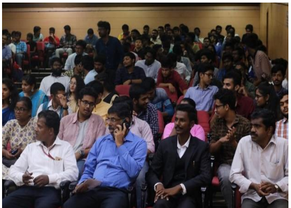
Technical Symposium of ICE Department- SENSORS 2018 (6<sup>th</sup> and 7<sup>th</sup> of October, 2018)