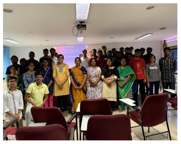
February 21<sup>st</sup> 2019 - Mathribasha Diwas Celebrations