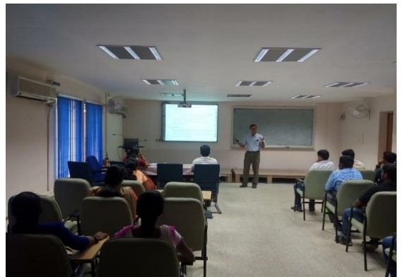
Guest lecture, 18th January 2019