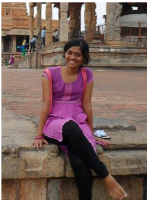
Vaishali S Content