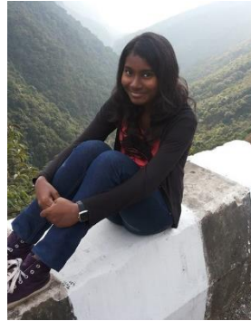
Navya Kiran Content