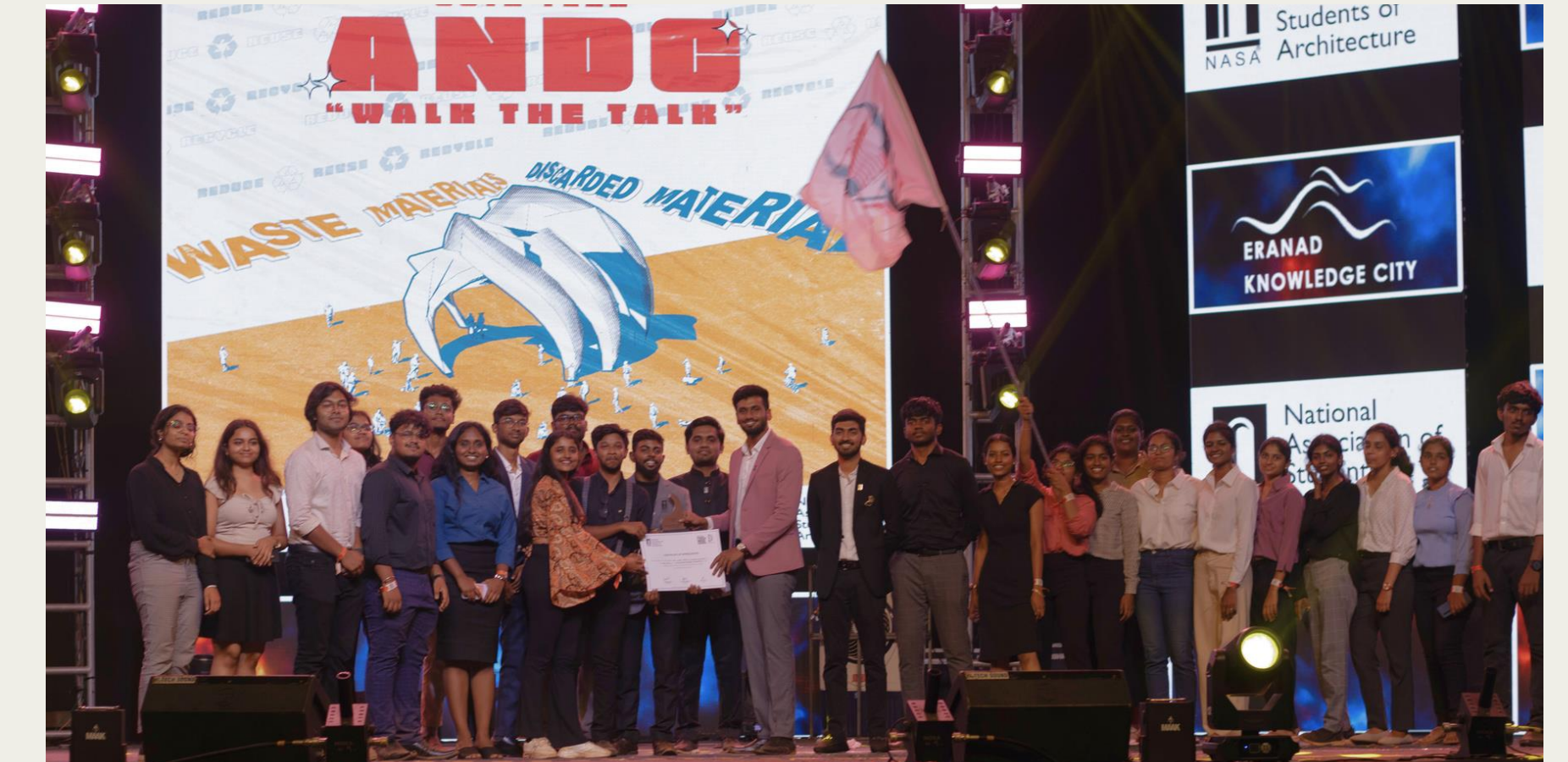
SPECIAL MENTION 3 - ANDC TROPHY