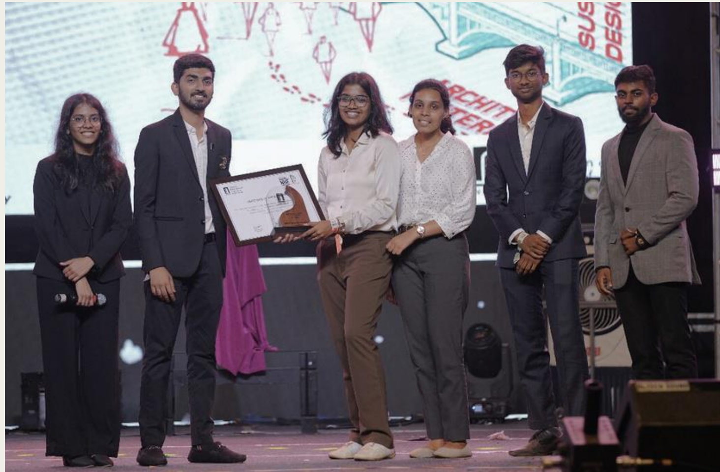
CITATION 1 - WRITING ARCHITECTURE TROPHY