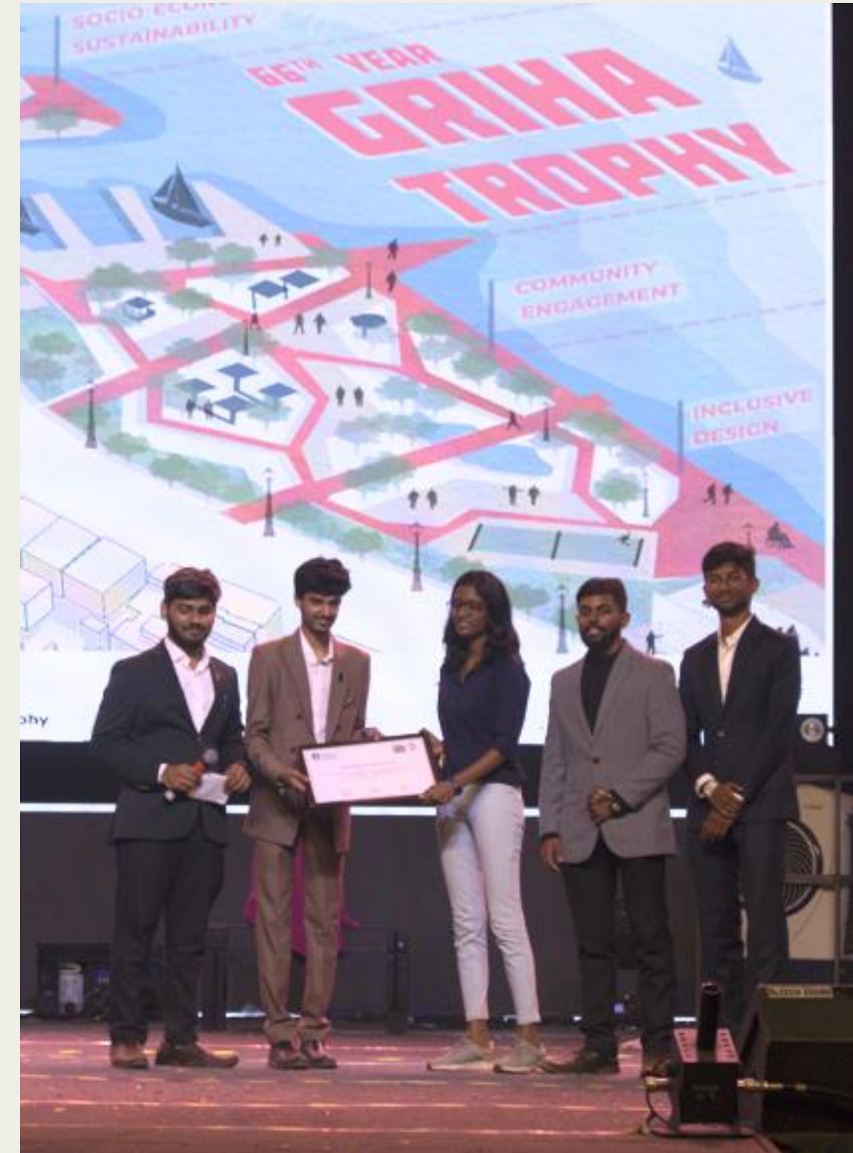
SPECIAL MENTION 1 - GRIHA TROPHY