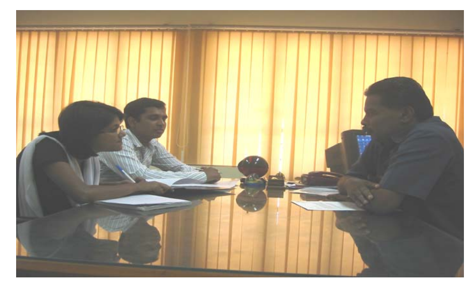
The following are some of the excerpts of an exclusive interview with him....