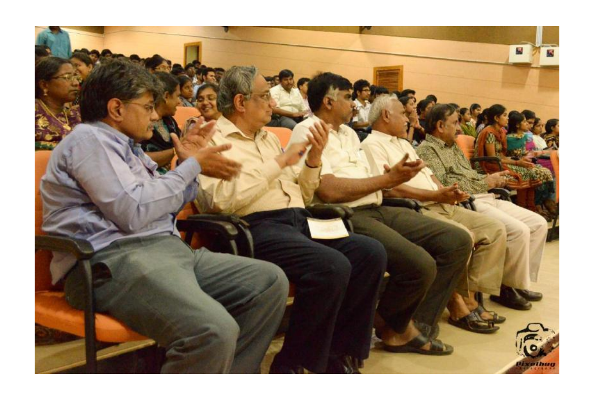
View of Audience in the Inaugural Function