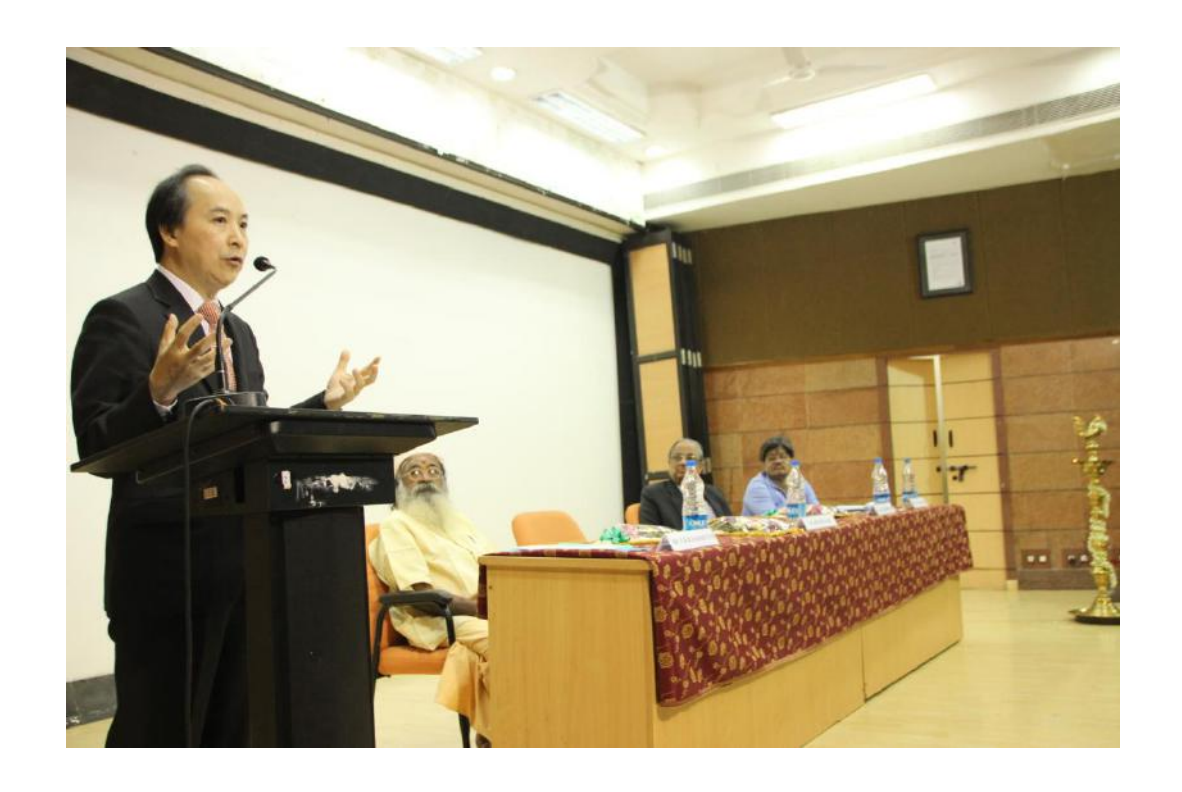
Workshop "Innovation, Sustainability, Solutions, Adoption, Implementation in Energy Environment Ecosystem and Human Life during 23<sup>rd</sup> and 24<sup>th</sup> January 2014 under TEQIP II organized by