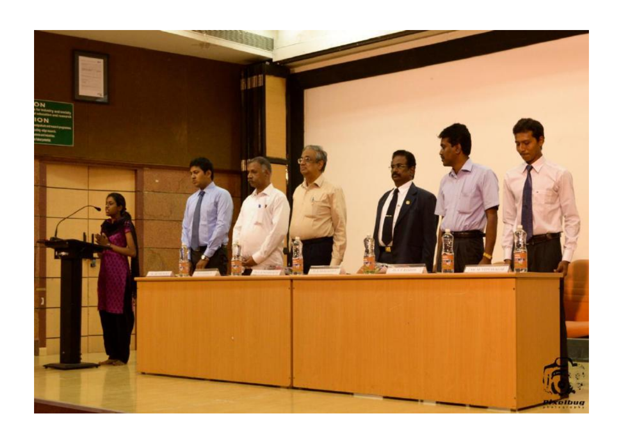
Inauguration of Civil Engineering Association