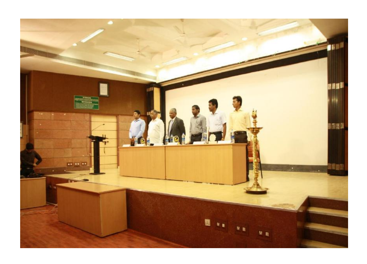
Inauguration of Moments-14