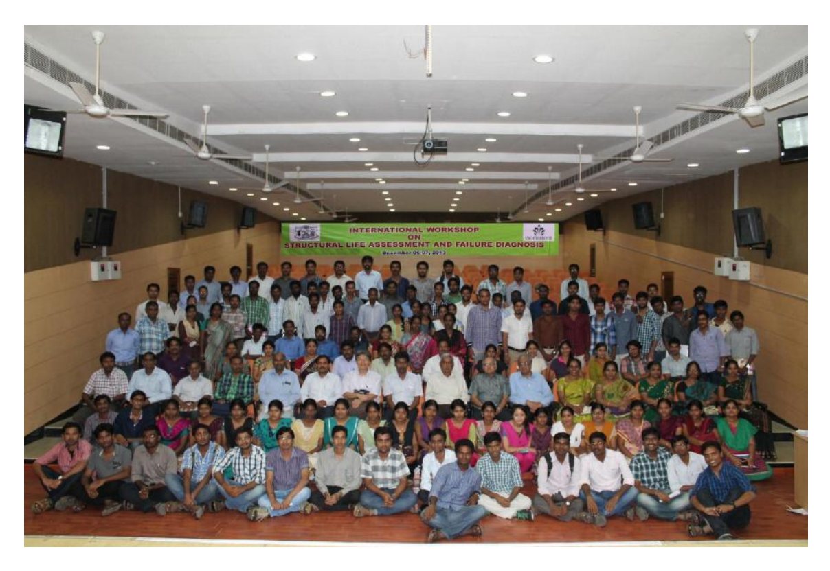
International Workshop on Structural Life Assessment and Failure Diagnosis