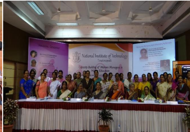
Capacity Building of Women Managers