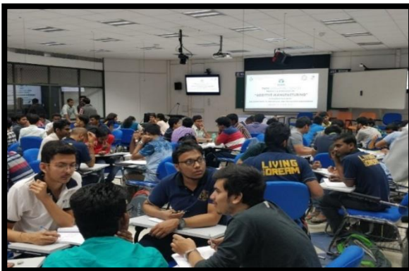
Advanced manufacturing workshop conducted in association with Tata Consultancy Services Ltd. (20 th January 2018)