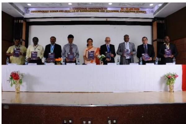
Inauguration of International Conference on Contemporary Design and Analysis of Manufacturing and Industrial Engineering Systems (CDAMIES-2018) Jan18-20