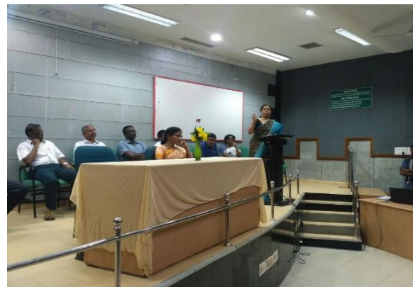
M.Tech. Data Analytics Inaugural Function – 31 st July 2017