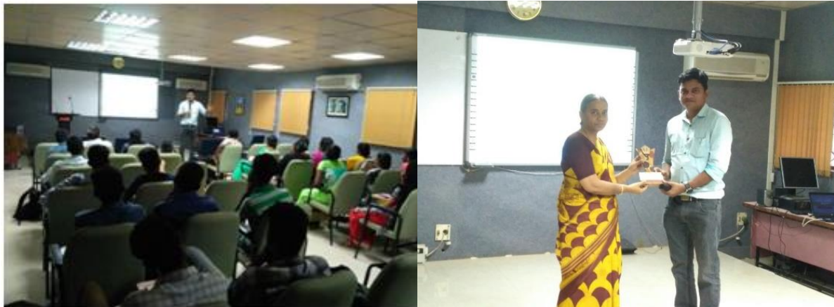
Short term course on "Waste management: Practices and Case studies", 28 th August – 1 st Sep2017