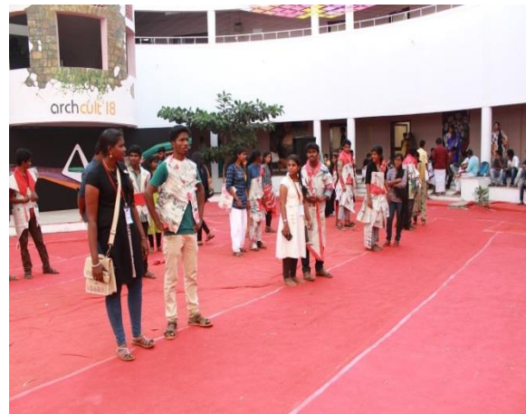
Archcult 18 – Department Cultural Event - 9 th to 11 th March 2018