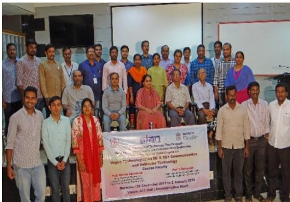
GIAN Workshop 2018