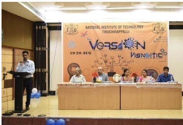
MCA – Version 2017 (19 th and 20 th August 2017) and M.Sc.(CS) – Optima 2017 (13 th October 2017)