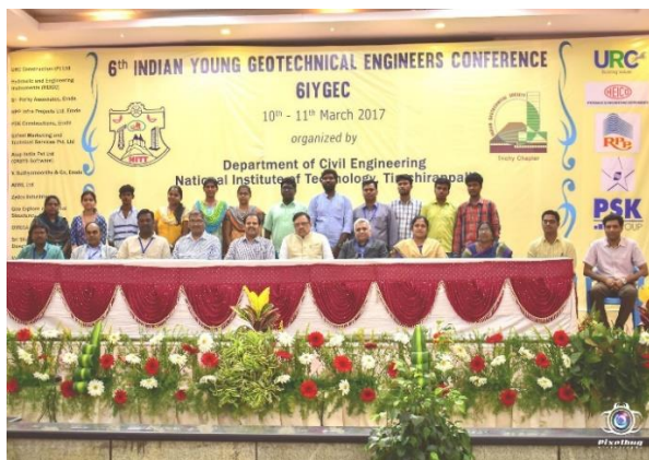
6 th Indian Young Geotechnical Engineering Conference