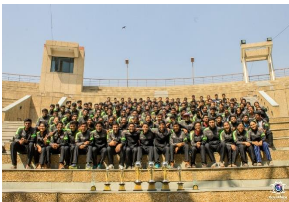
Udghosh'17 – IIT Kanpur