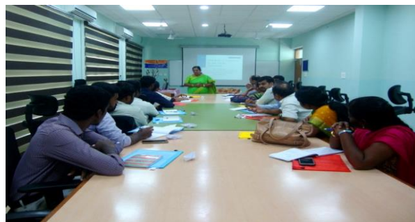
FDP on "Empowering Teachers in Life Skills Education"