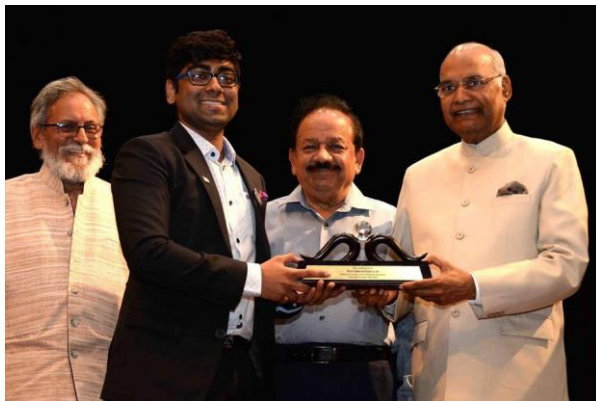
President's Best Innovation Club Rolling Trophy to NITT