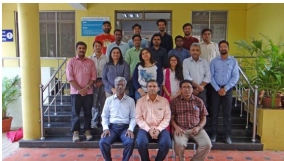
GIAN Workshop on "Current Global Economic Issues and Policies in Indian Context"