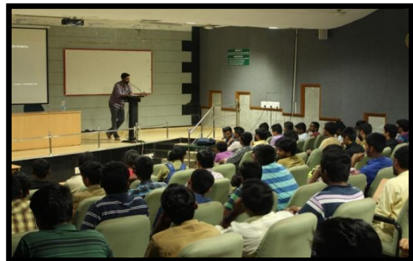
Interactive intern talk to prospective students by final year abroad interns (16 th January 2018)