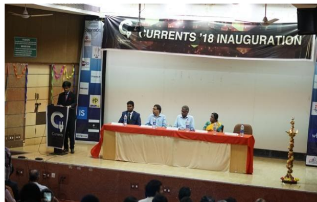
Currents - Feb 2018