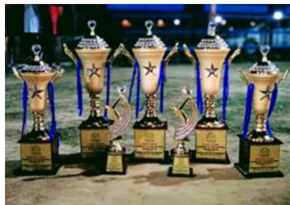
All India Inter NIT Tournament – Kurukshetra