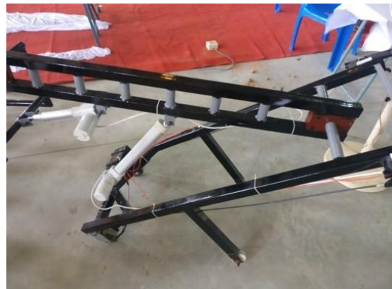
VRex - DC Club