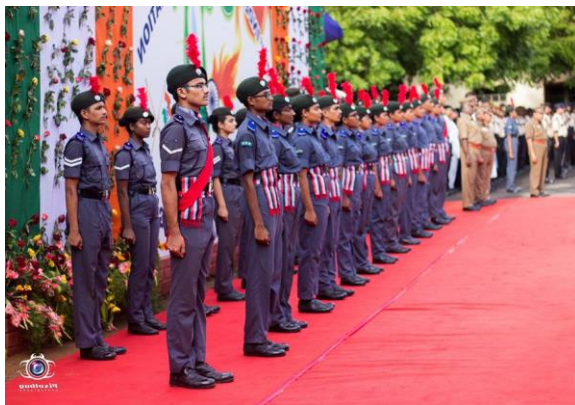
Independence Day 2017