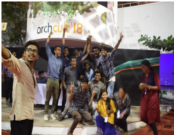
Archcult 18 – Department Cultural Event - 9 th to 11 th March 2018